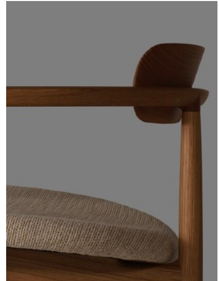
Miao Lounge Chair (Upholstered Seat) : Oak / Walnut, Textile / Leather, W672 x D599 x H637 (SH 379) mm