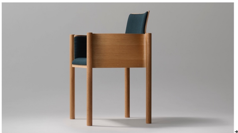
KAWARA Armchair in oak natural, upholstered seat in ALLE 984

The other is CLAY by Sahco, a popular textile that brings together natural beauty and a sense of finesse. Mixed colors of yarn in warp and weft, create an elegant yet casual fabric.