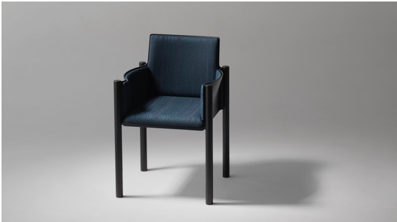
KAWARA Armchair in oak natural black, upholstered seat in ALLE 884