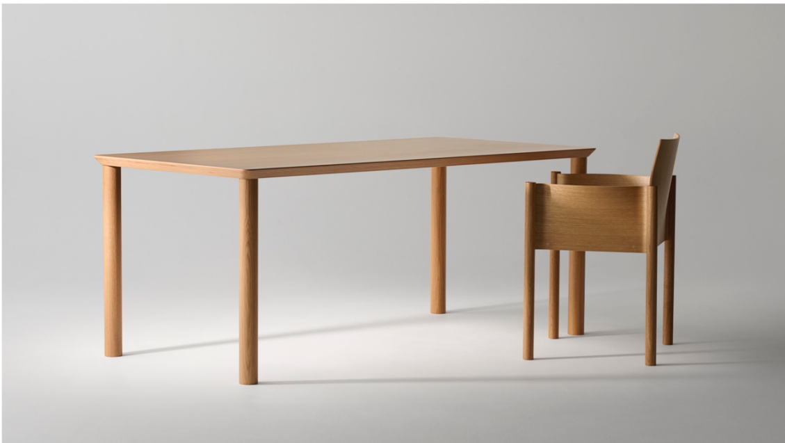
Usurai table designed by Ronan & Erwan Bouroullec.

KOYORI is gearing up for the Milan Design Week 2023 with the launch of two new tables and two new series of upholstery textiles, complementing the inaugural collection of furniture introduced by the brand last year. Like all KOYORI products, the new additions embody the distinct sense of Japanese aesthetics.