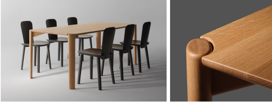
NEI table designed by Ronan & Erwan Bouroullec, Available in oak and in round and rectangular shapes.

Among the the two new tables designed by Ronan & Erwan Bouroullec, one is the NEI table made in solid wood, using high precision cutting and joining techniques. The shape of the tabletop and the natural curvature of the leg work in perfect harmony to bring out the beauty of the table, which is set to be the next torchbearer of the KOYORI brand.